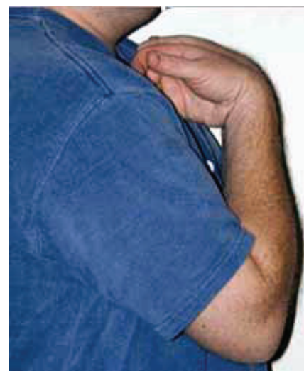
Sleeping with your elbow bent can aggravate symptoms.

X-rays. These imaging tests provide detailed pictures of dense structures, like bone. Most causes of compression of the ulnar nerve cannot be seen on an x-ray. However, your doctor may take x-rays of your elbow or wrist to look for bone spurs, arthritis, or other places that the bone may be compressing the nerve.