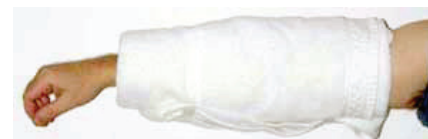
Loosely wrapping a towel around your arm with tape can help you remember not to bend your elbow during the night.