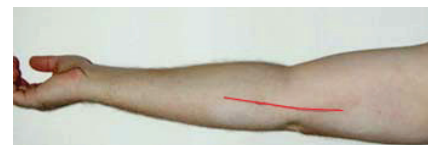
For anterior transposition of the ulnar nerve, an incision is made along the inside of the elbow.

Medial epicondylectomy. Another option to release the nerve is to remove part of the medial epicondyle. Like ulnar nerve transposition, this technique also prevents the nerve from getting caught on the bony ridge and stretching when your elbow is bent.