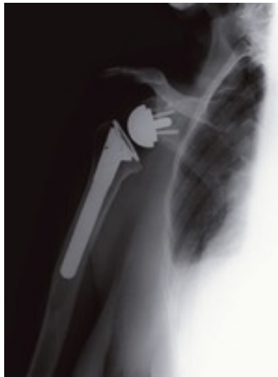
A typical follow-up x-ray of a reverse total shoulder replacement.

After surgery, your medical team will give you several doses of antibiotics to prevent infection, and pain medication to keep you comfortable. Most patients are able to eat solid food and get out of bed the day after surgery. You will most likely be able to go home on the second or third day after surgery.